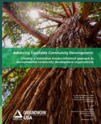
Trauma –Informed Equitable Development