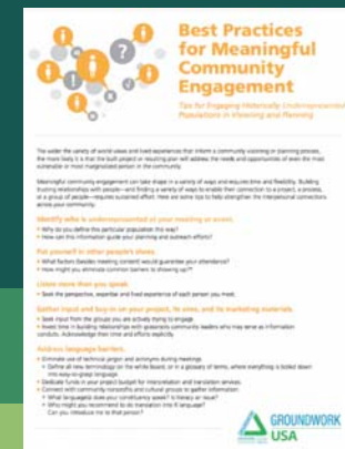
Best practices and action plans