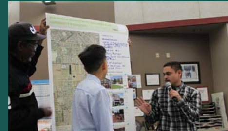
Neighborhood Voices Curriculum