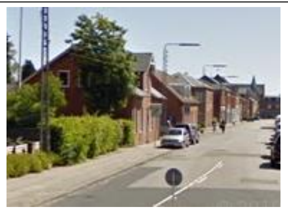
Red brick buildings along Vestergad Street, Haslev, date from the 19<sup>th</sup> century and currently are used for shops and residences. Neither structural nor cosmetic damage were allowed.

The building housing the dry cleaner, as well as its neighbors, was deemed to be sound and valuable