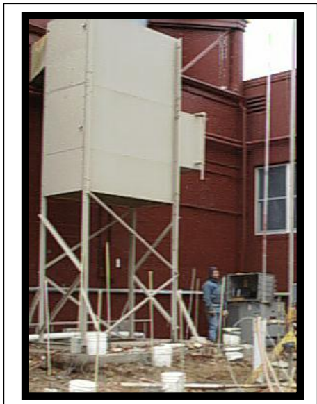
This air-handler, which was constructed on a 4-inch thick concrete pad, was elevated by fractures created at a depth of seven feet. Hydraulic fractures were created from a boring located at the lower, rightmost corner of this photograph – at the base of the yellow hoist unit. The staffs were used to measure uplift while the buckets protected tiltmeters.

The building consisted of a multi-story, brick structure built upon a deep and wide concrete foundation. Interior steel trusses and floors were commensurate with heavy manufacturing. In aggregate, the building exerted considerable load on the supporting soil, and fractures were not expected to penetrate beneath it. Still, surveying methods were employed and verified the building to be immobile within 0.25 mm.