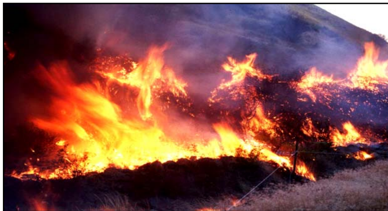
Techniques for reestablishing plant cover after wildfires have been developed by Plant Materials Centers and Plant Materials Specialists.