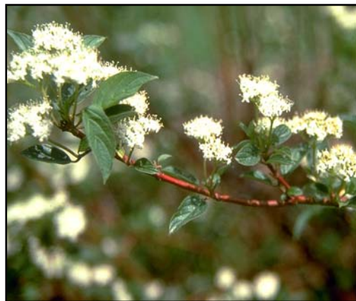
'Ruby' redbud dogwood was released to stabilize soil on streambanks. With its attractive flowers and red stems, 'Ruby' is also useful for landscape plantings.

Plant Materials Centers evaluate plants for specific conservation traits, select top performers, and make these materials available to the public as conservation plant releases. They also develop innovative ways for land managers to use and manage a variety of conservation plants. Specialists relay information about new plant releases and offer on-the-ground assistance with conservation plantings.