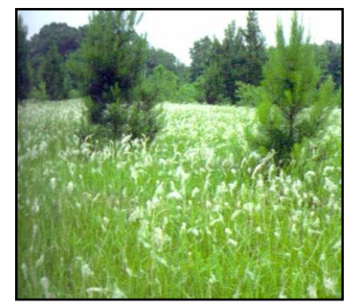
Cogongrass ( Imperata cylindrica ) is an invasive plant species in the Southwest

native plants which are especially adapted to these difficult sites to help prevent infestation by noxious weeds such as knapweed species, Canada thistle and cogongrass.