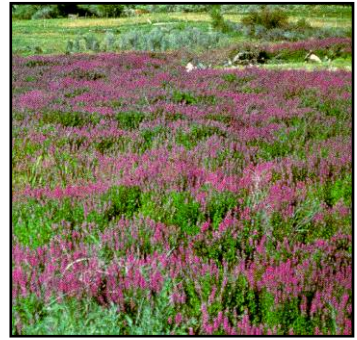
Despite its beauty, purple loosestrife ( Lythrum salicaria ) is one of the worst invasive plant species.

management technologies for plant species that ultimately can be used to help restore devastated areas. Additionally, Plant Material Specialists are trained to plan appropriate conservation treatments and work with partners to address these affected areas.