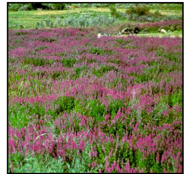
Despite its beauty, purple loosestrife ( Lythrum salicaria ) is one of the worst invasive plant species.

Undeterred against these challenges, the Program continues to find new technologies to address these resource concerns. This new technology is developed at the Program’s 27 Plant Materials Centers (PMC) across America that select, study and release plants and develop planting and management technologies for plant species that ultimately can be used to help restore devastated areas. Additionally, Plant Material Specialists are trained to plan appropriate conservation treatments and work with partners to address these affected areas.