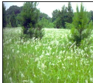
Cogongrass (Imperata cylindrica) is an invasive plant species in the Southwest

Highly disturbed areas, such as those associated with minelands, saline sites, roadsides and highly acidic sites, are very susceptible to invasion by noxious weeds. Several PMCs are evaluating native plants which are especially adapted to these difficult sites to help prevent infestation by noxious weeds such as knapweed species, Canada thistle and cogongrass.