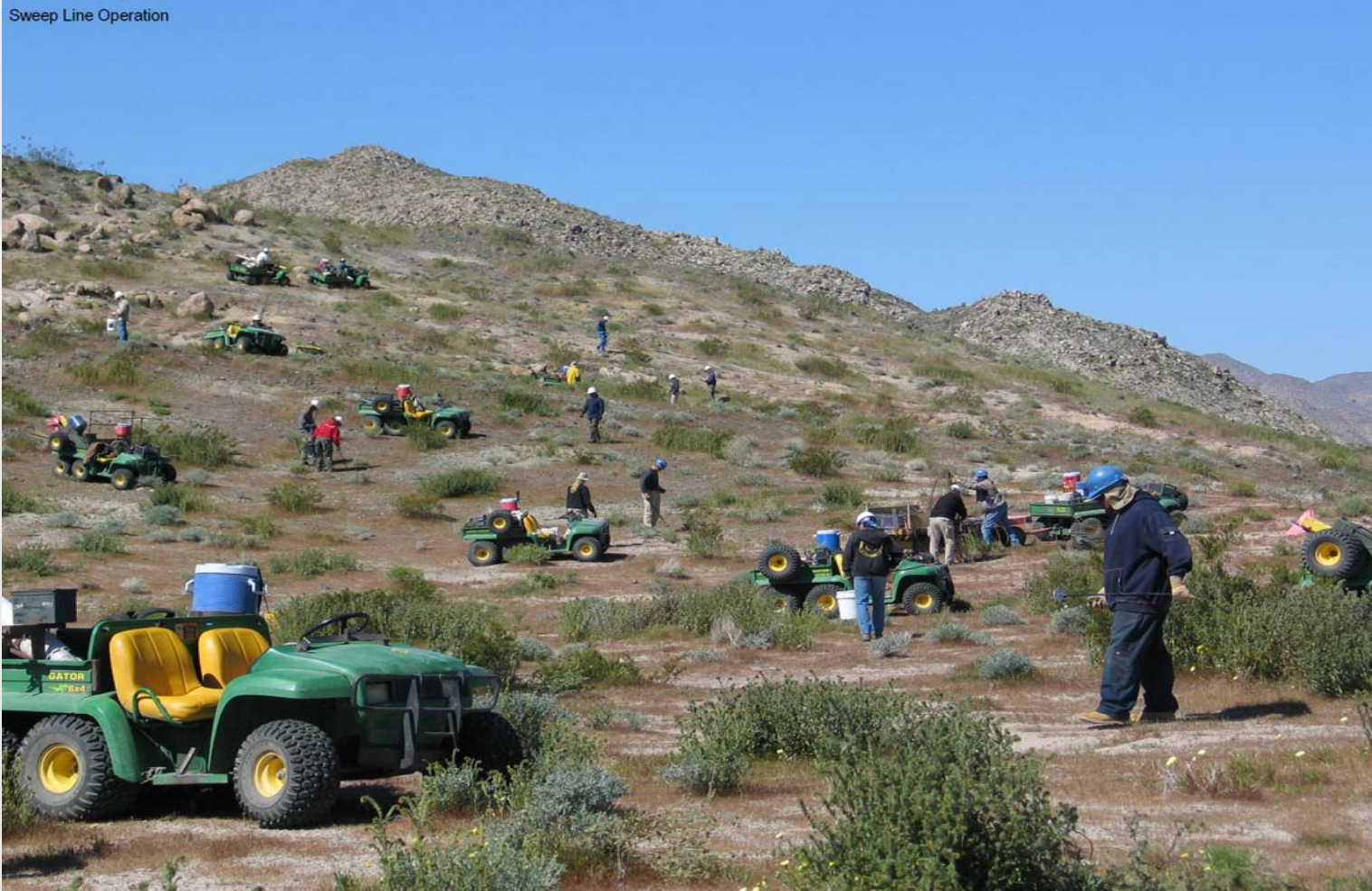
Sweep Line Operation