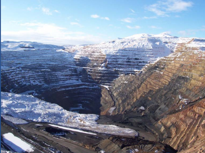
Gold Quarry Mine, NV