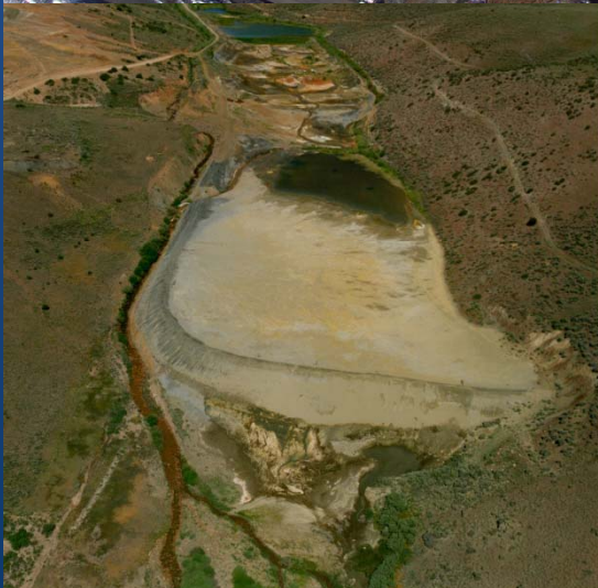
Rio Tinto Mine, NV