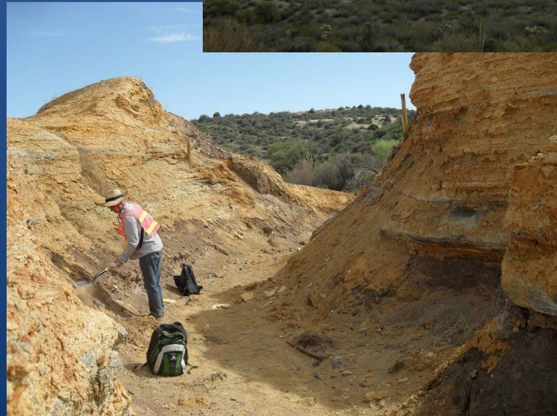
Iron King Mine, AZ