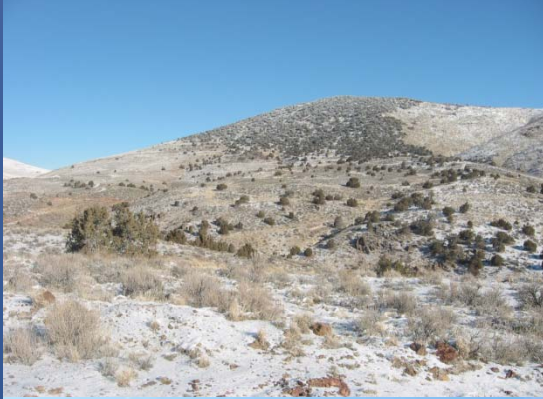
Emigrant Mine, NV