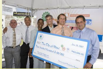
City of Miami is awarded Assessment Grants, 2007.