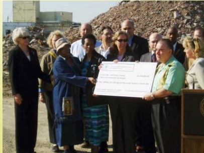
City of Louisville (KY) is awarded Assessment Grants, 2007.

EPA Brownfields ARC grants are very competitive, yet attainable. Applicants should be prepared to put time and effort into constructing a winning proposal.