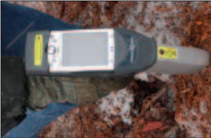
Hand held XRF analyzer being used for in-situ field screening of soil sample.

(exit criteria) for terminating or continuing the site activity and its monitoring program. This document is not intended to specify the scale, complexity, protocols, data needs or investigation methods for meeting the needs of site-specific monitoring. Rather, it presents a framework that can be used to develop and implement scientifically defensible and appropriate monitoring plans that promote national consistency and transparency in the decision-making process.