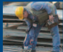
Verify alloy chemistry grade and sort metal in seconds.

INNOV-X SYSTEMS ™ Innovative XRF Technologies