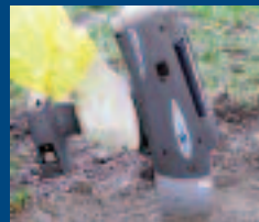
In-situ testing for fast, thorough site delineation and investigation.

To find out more, contact Innov-X today.