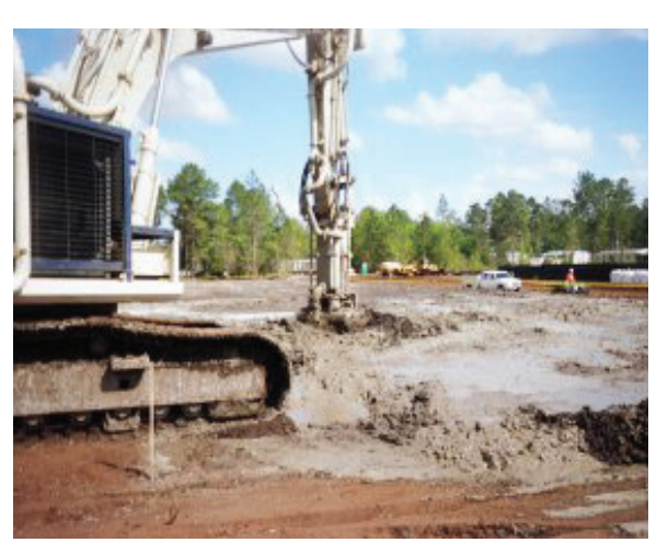
Large augers inject and mix binding agent with contaminated soil.

additives The used in solidification and stabilization often are materials used in construction and other When properly activities. handled, these materials do not pose a threat to workers or your community. Water or foam can be sprayed on the ground to make sure that dust and contaminants are not released to the air during excavation or mixing. If necessary, the waste can be mixed inside tanks, or the mixing area can be covered