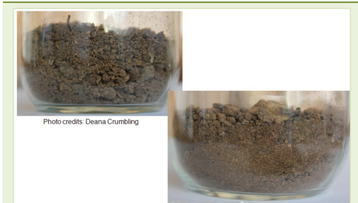
Figure 5. Freshly collected soil sample (left) versus the same sample after the jar was shaken for 15 minutes (right), showing particle segregation caused by gravity.

associate with smaller particles, and since larger particles segregate near the top, subsampling by scooping off the top biases the subsample towards less contaminant-laden particles and analytical results that are lower than the true concentration of the sample. On the other hand, other subsampling activities, such as selectively tapping fine particles into the subsample while it is gradually brought toward the target subsample weight, can introduce bias in the other direction.