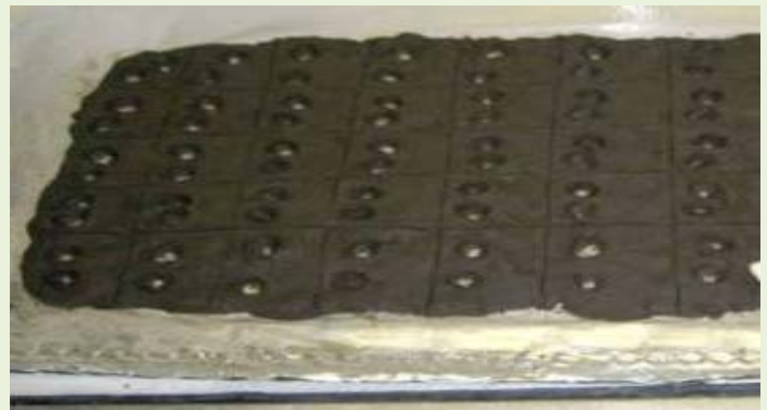
Figure 2. A laboratory duplicate requires another incremental subsample to be collected in the same way as the first.

different sizes that are composed of different materials. These micro-scale heterogeneities are important because the masses used for chemical analysis are small. Typically about one gram of soil is analyzed for inorganic constituents and five to 30 grams are analyzed for organic contaminants. It is important to recognize that soil does not behave as a liquid with evenly dissolved contaminants. Trace-level contamination (concentrations of parts per million and less) in soil is often attached to a relatively few discrete particles that are "sprinkled" unevenly throughout a bulk matrix of uncontaminated particles. Figure 3 illustrates such a trace contaminant distribution in a sample container.