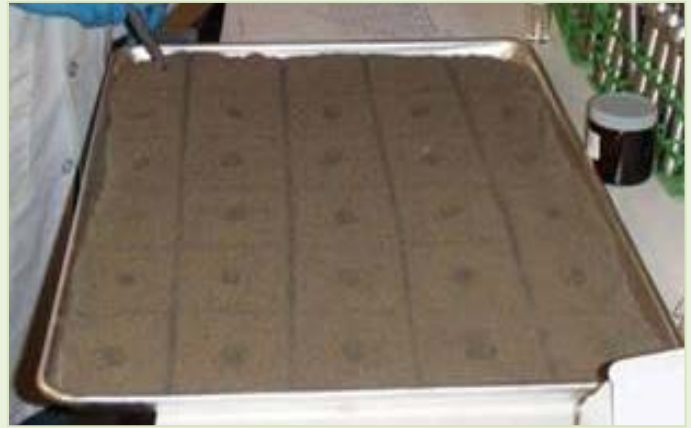
Figure 1. Photograph of a "2-D slabcake." 3,4 The processed field sample has been spread out and incrementally subsampled to create a single analytical sample.