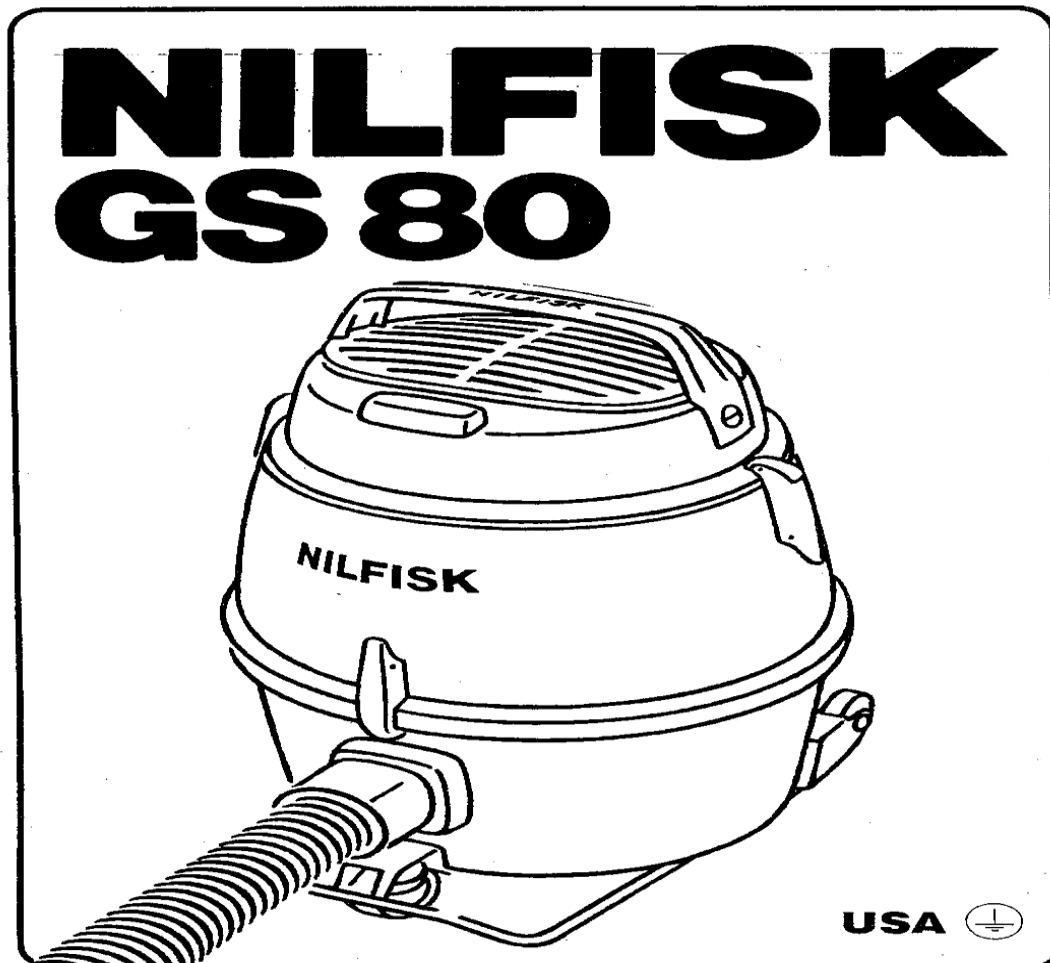
FIGURE 1. GS-80 Dust Sampling Apparatus