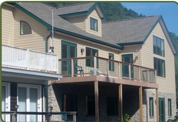
The Lehigh Gap Nature Center

Traditional cleanup techniques, which included removal of contaminated soil and associated smelting residue from the over 2,000-acre site, was initially estimated to cost more than $4 billion and take up to 45 years to complete. While total costs for all revegetation activities are not available, the responsible parties estimate that it cost approximately $9 million to reclaim the initial 850 acres of Blue Mountain. Risk assessments and extensive testing was required to ensure that this approach would be protective as well as cost effective. A significant portion of the initial cost for revegetation of the first 850 acres was associated with construction of over 60 miles of switchback roads for truck access. Subsequent revegetation activities (the remaining portion of Blue Mountain, the cinder bank, and Stoney Ridge) used planes and did not require roads construction; therefore, the anticipated cost per acre is expected to be lower than for the initial 850 acres.