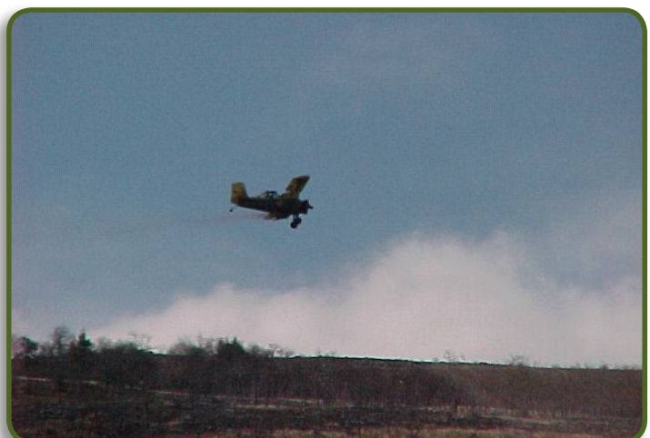
Soil amendment and seed mixture applied using a plane

While continuing the revegetation activities, contractors addressed additional challenges using creative methods. Initially, land owned by the responsible parties was revegetated using a spreader truck which required over 60 miles of roads to be constructed. For privately-owned land, a modified agricultural tractor and spreader were used to apply the soil amendment and seed mixture. On