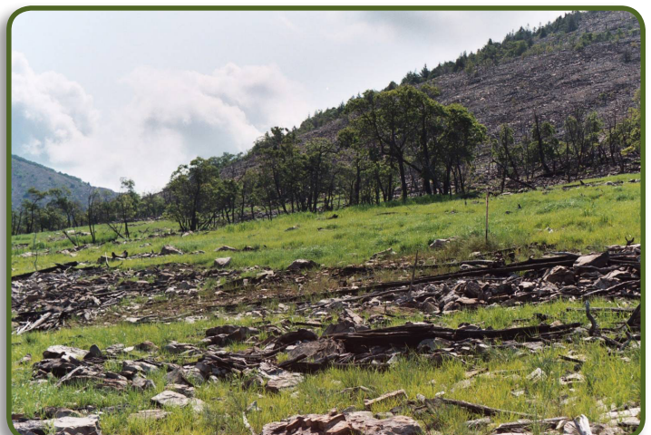
Blue Mountain revitalization in (left) October 2002 and (right) August 2003