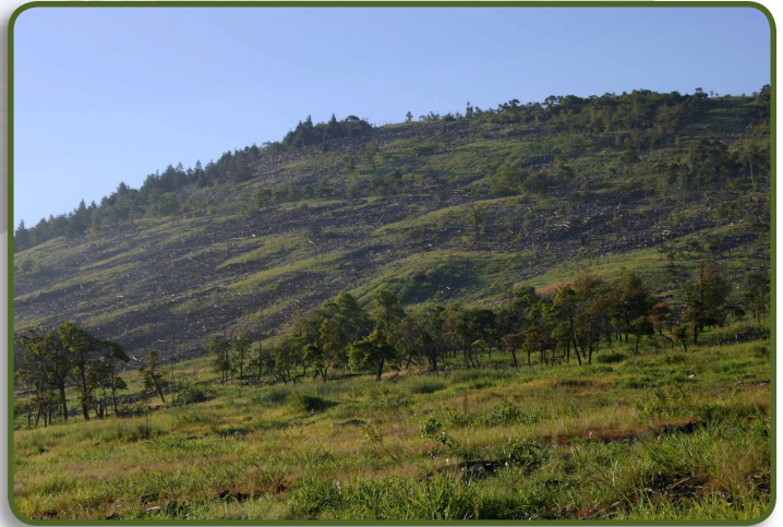
Blue Mountain revitalization in (left) September 2004 and (right) August 2006

more than 70 percent vegetative cover with increasing emergence of volunteer tree species.