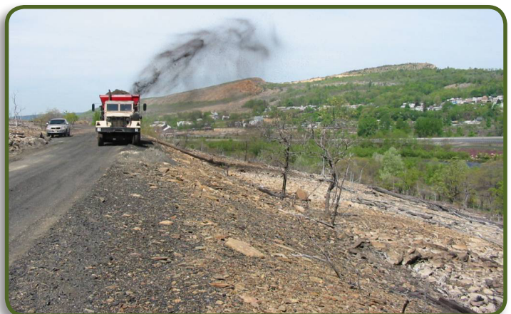
Soil amendments applied using a spreader truck

The sheer size of the Palmerton site resulted in a lengthy cleanup process. Initially, surface water was diverted around the cinder bank, and a treatment system for the leachate was installed. The longer term remedy for both the cinder bank and denuded areas of Blue Mountain included revegetation. The remedy used techniques that evolved over time and considered up-to-date knowledge regarding successful revitalization techniques. Originally, the Record of Decision required revegetation to prevent continued erosion into