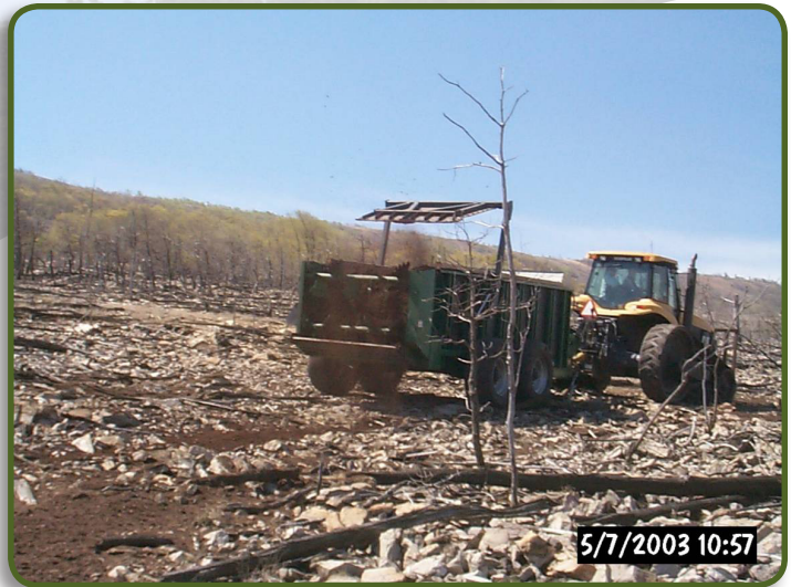
Mushroom compost, fertilizer, lime, and seed mix applied using a tractor/spreader

Initial revegetation activities were successful, but as time went on, the specific soil amendment mix developed a negative public perception because it included the use of municipal sewage sludge. Contractors at