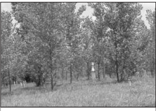
Willow and poplar trees removing tritium from the groundwater at Argonne National Laboratory.

Website: http://www.sciencedirect.com/science/journal/00489697