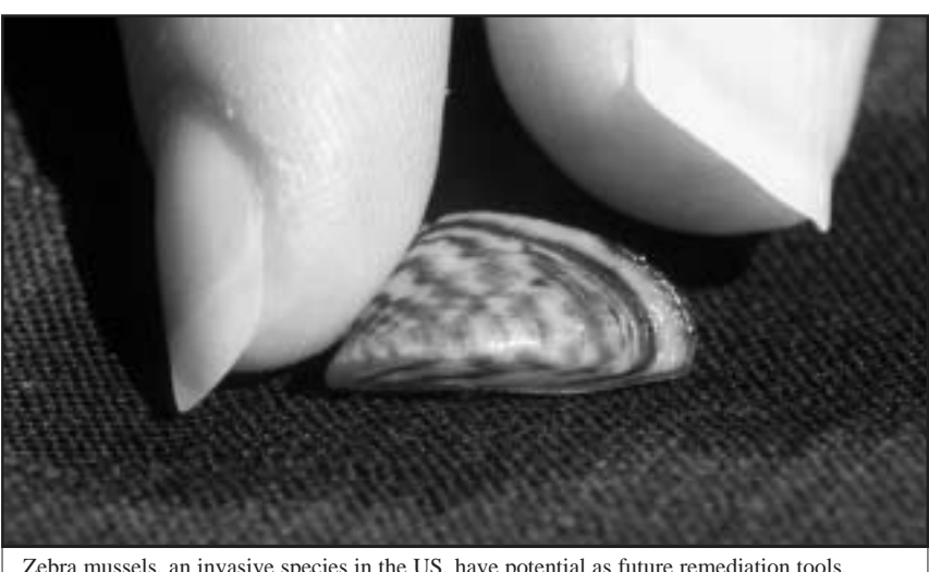
Zebra mussels, an invasive species in the US, have potential as future remediation tools.

Website: http://www.sciencedirect.com/science/journal/ 0265931X