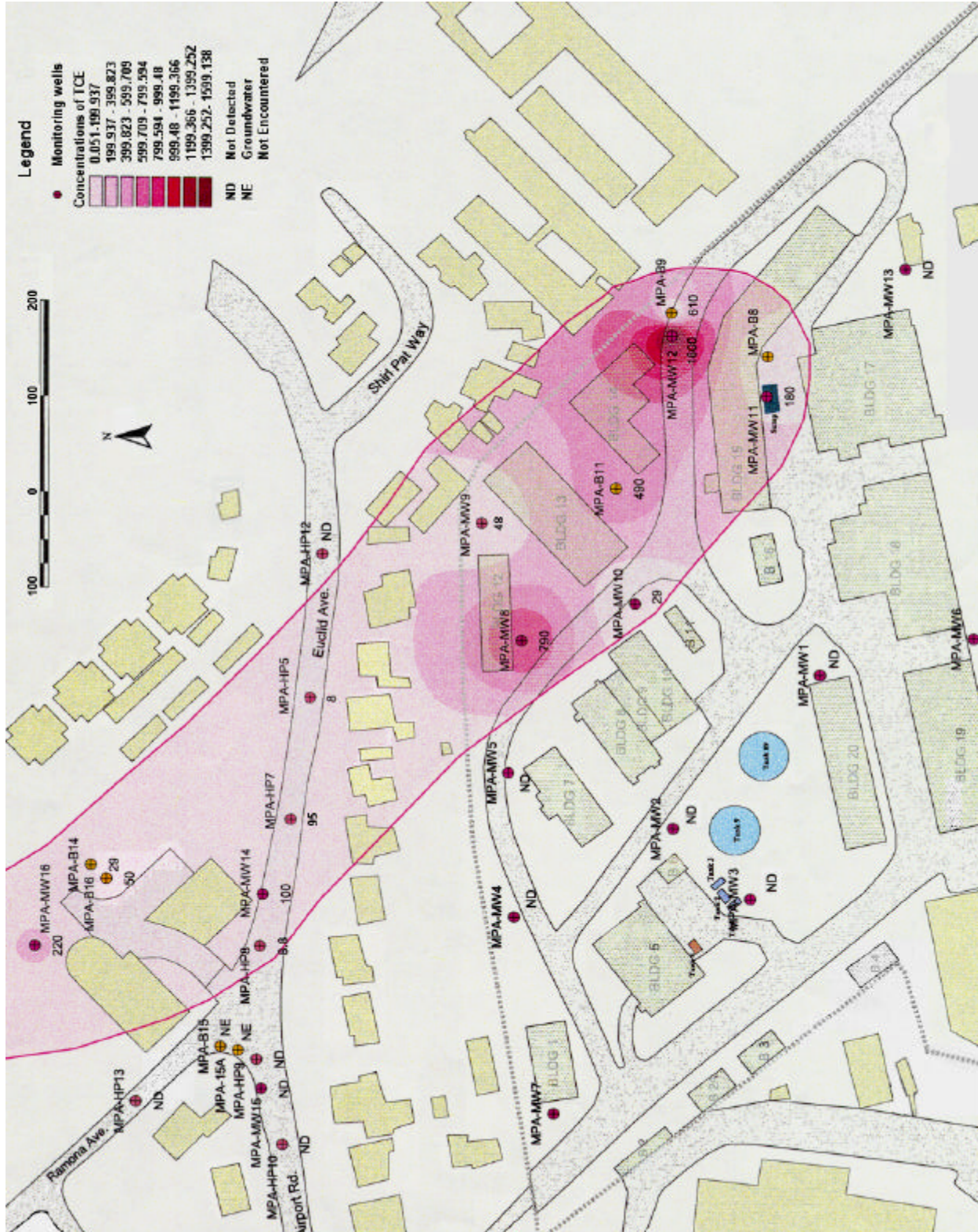
FIGURE 2: EXTENT OF TCE PLUME

Figure 2 provides a graphic representation of the TCE plume, showing placement of the soil borings, monitoring wells, and temporary wells.