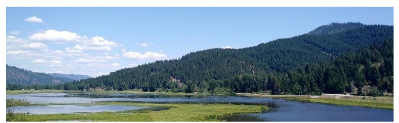
Agriculture-to-wetland project at the Lower Basin of Coeur d'Alene River Superfund site in northern Idaho.