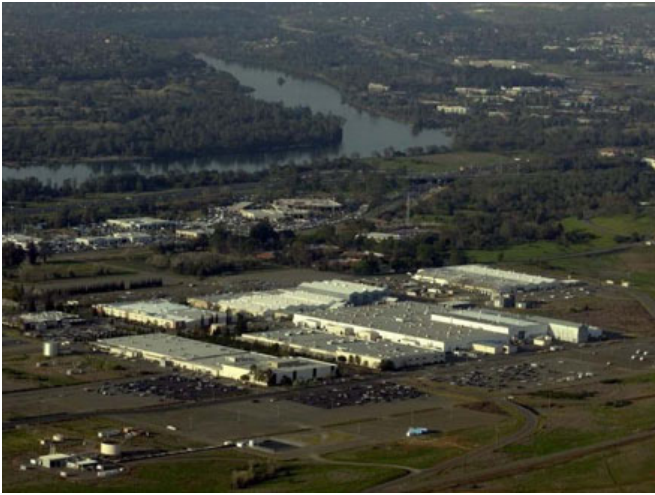
Siting Setting: The American River flows about one-half mile north of the Aerojet property. The property covers approximately 9 square miles between the cities of Folsom and Rancho Cordova and approximately 15 miles from Sacramento.