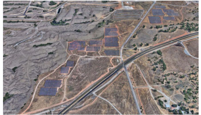
Completed Solar Farm: The fully operational 6 MW solar farm encompasses more than 29,000 individual solar panels covering 40 acres along White Rock Road.