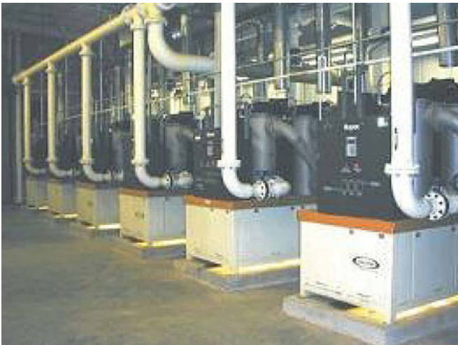
UV Reactors: Groundwater has been treated by UV reactors at two of the three onsite groundwater treatment plants since the mid 1980's. Currently, UV technology is used at three offsite plants.