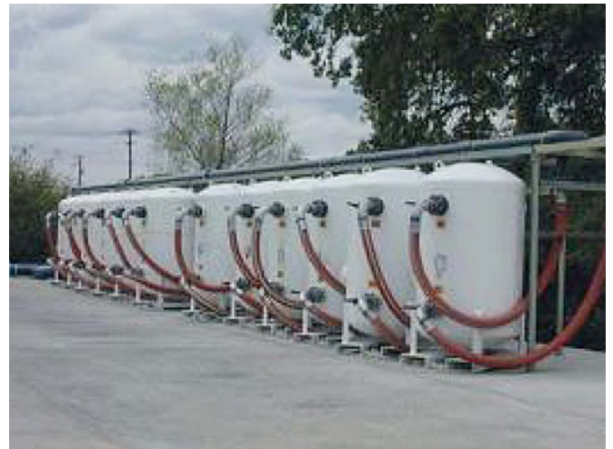
Ion Exchange Vessels: Ion exchange technology is used at three of the onsite groundwater treatment plants and two of the offsite plants.