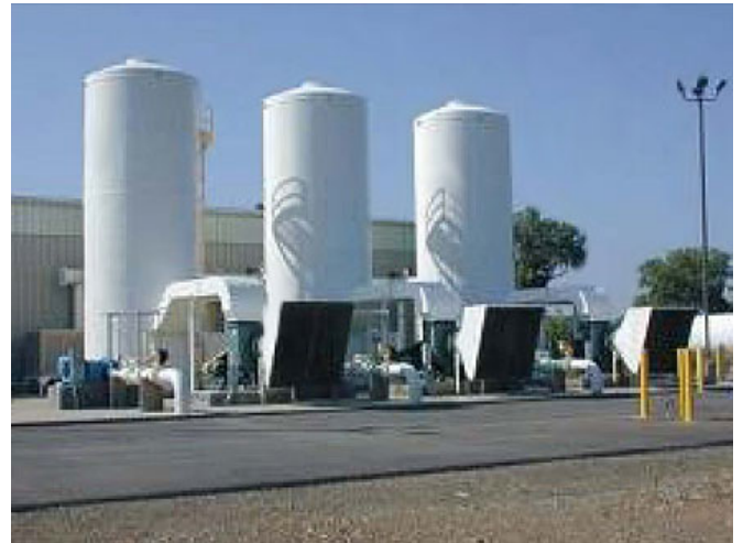
Air Stripping Towers: This onsite plant uses air stripping as well as UV/peroxide, ion exchange and biodegradation technologies to remove VOCs, NDMA and perchlorate from groundwater at a flow rate of 5,200 gallons per minute.