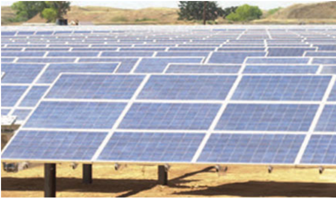
PV Module Placement: The rows of PV modules provide sufficient space for monitoring wells that may be needed in the future. The absence of concrete footings for the modules enables precipitation to infiltrate the subsurface and fosters passage of wildlife.