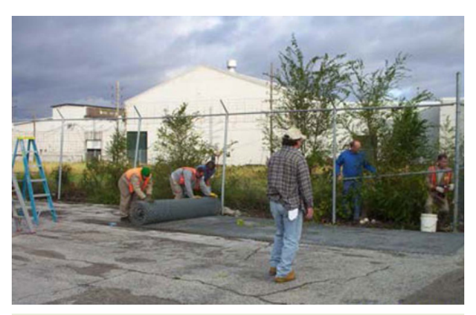
Fencing Reuse: Volunteers dismantled and removed 8-foot chain link fencing no longer needed at the main plant area and re-installed it in certain sections of the regional Nickel Plate recreational trail.