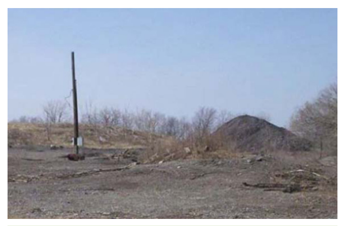
Soil Stockpiling: Soil excavated from the slag processing area was screened for lead content and segregated onsite in accordance with risk-based acceptable levels for industrial use. Slag waste with lead concentrations within the acceptable limits was stockpiled (as shown on right) for use as fill in onsite areas where land use is limited through institutional controls.