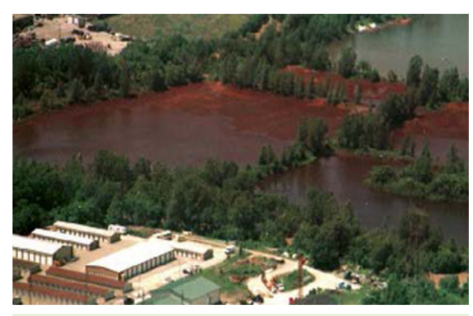
Former Acid Lagoons: The 56-acre acid lagoon area contained 10 lagoons that received spent pickling and finishing liquors from the main plant. Prior to remedy construction, the area's settling ponds were stabilized through acid neutralization.