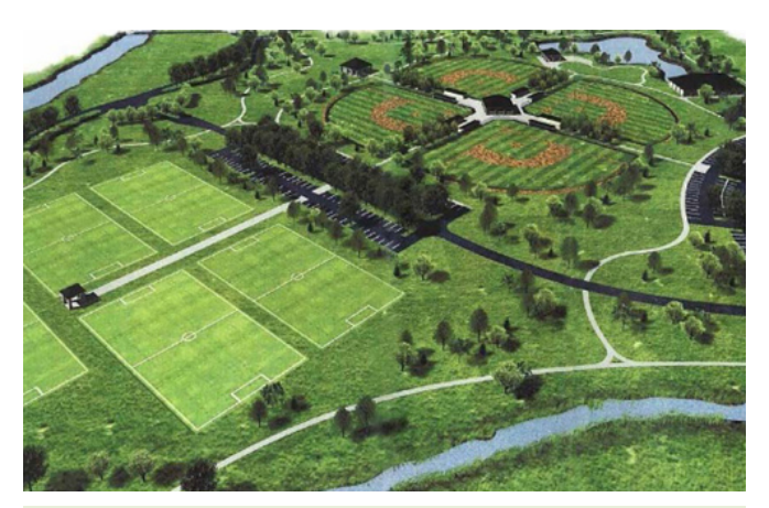
Lagoon Area Conceptual Plan: Following excavation and backfilling, soil containing residual contaminants in the former lagoon area was capped with clean soil. The area now hosts a 60-acre soccer complex constructed by the Kokomo/Howard County Convention & Visitors Bureau. Current efforts focus on improving the area's drainage and accelerating grass re-growth.