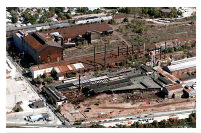
Prior to Demolition: From 1914 to 1986, the Continental Steel Corp. facility in Kokomo produced nails, wire and wire fence from scrap steel. Onsite manufacturing operations involved use, handling, storage and disposal of hazardous materials. The steel-making operations included material reheating, casting, rolling, drawing, pickling, galvanizing, tinning and tempering. The main plant area continues to be zoned for industrial use.