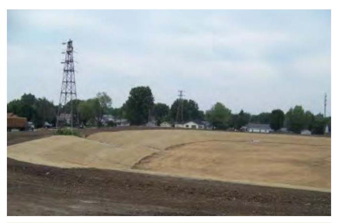
Stormwater Management Infrastructure: The onsite stormwater retention pond created in the former quarry area collects clean stormwater accumulating on the site as well as stormwater diverted from adjacent neighborhoods.