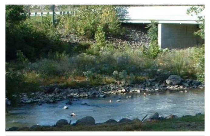
Creek Bank Armoring: Large granite field stones were extracted from imported clean fill and used to stabilize onsite banks of Kokomo Creek and Wildcat Creek, which runs below a local transportation corridor (Dixon Road).