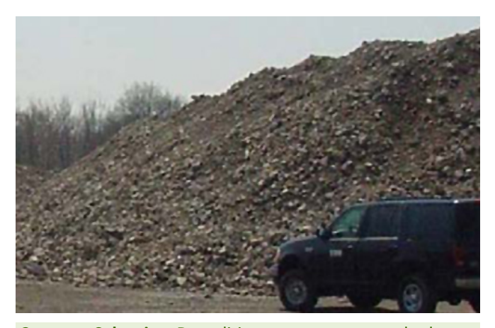
Concrete Salvaging: Demolition concrete was crushed onsite and stockpiled for use as fill at the main plant area after its excavation was complete.