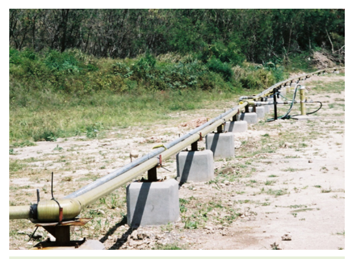
Fluid Handling: The recovered fluids containing commingled oil and groundwater are transported from the extraction wells to oil-water separation tanks at the adjacent petroleum facility via aboveground fiberglass lines that are coupled with steel lines for distributing the compressed air.