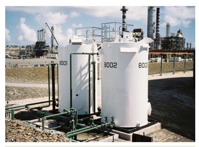
Recovered Product: Recovered subsurface fluid accumulates in aboveground tanks at the adjacent petroleum facility, where recovered oil is reclaimed for beneficial use.