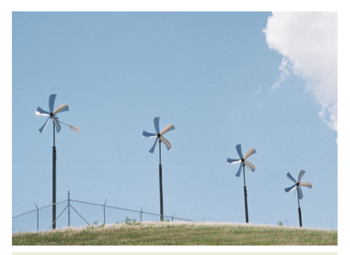
Wind Field: Prior to 2011, when this wind field was taken out of service, trade winds averaging 11 mph brought nearly a constant source of renewable energy for remediation at the Former St. Croix Alumina site.