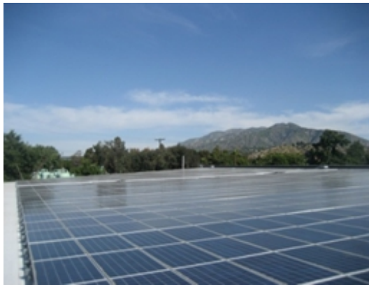
The grid-connected PV system consists of 2,772 silicon PV modules covering more than 50,000 square feet of the roof above the "Windsor Well" pumping station.

Electricity consumption of the optimized Monk Hill treatment system totals 1,949 kWh per million gallons of water treated in contrast to the original baseline of 2,150 kWh per million gallons of water treated.