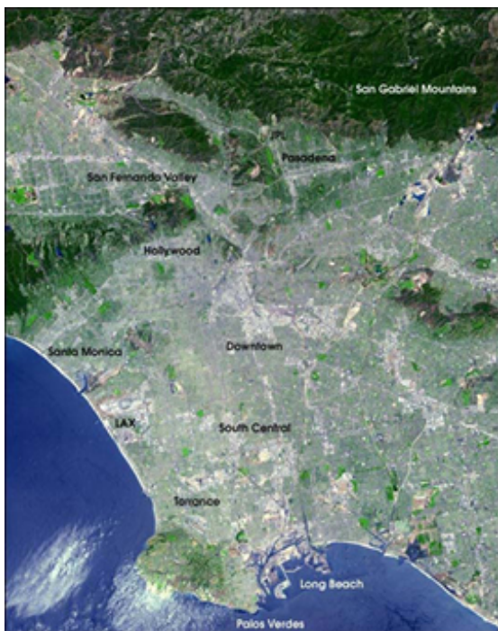
JPL is located in the upper Los Angeles River Basin, which provides 6% of California's habitable land and only 0.06% of the state's stream flow - but 45% of the state's population.