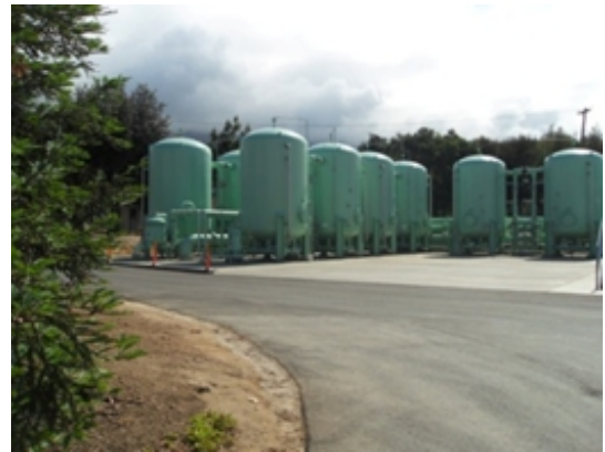
The new municipal water treatment plant handles contaminated groundwater extracted by the four previously closed and now upgraded water production wells.