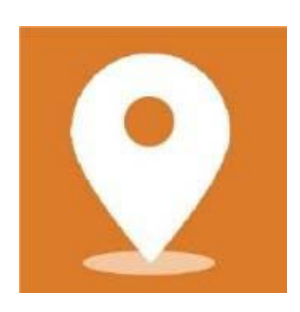
Project Response Teams