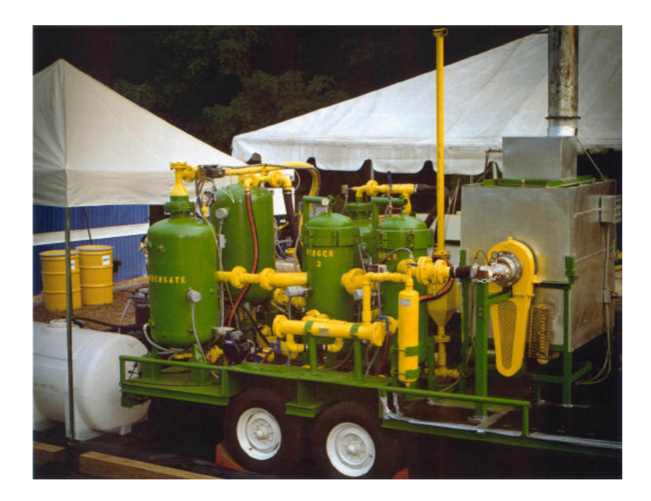
Figure 1. Photograph of the SepraDyne<sup>™</sup>-Raduce trailer mounted rotary retort system.