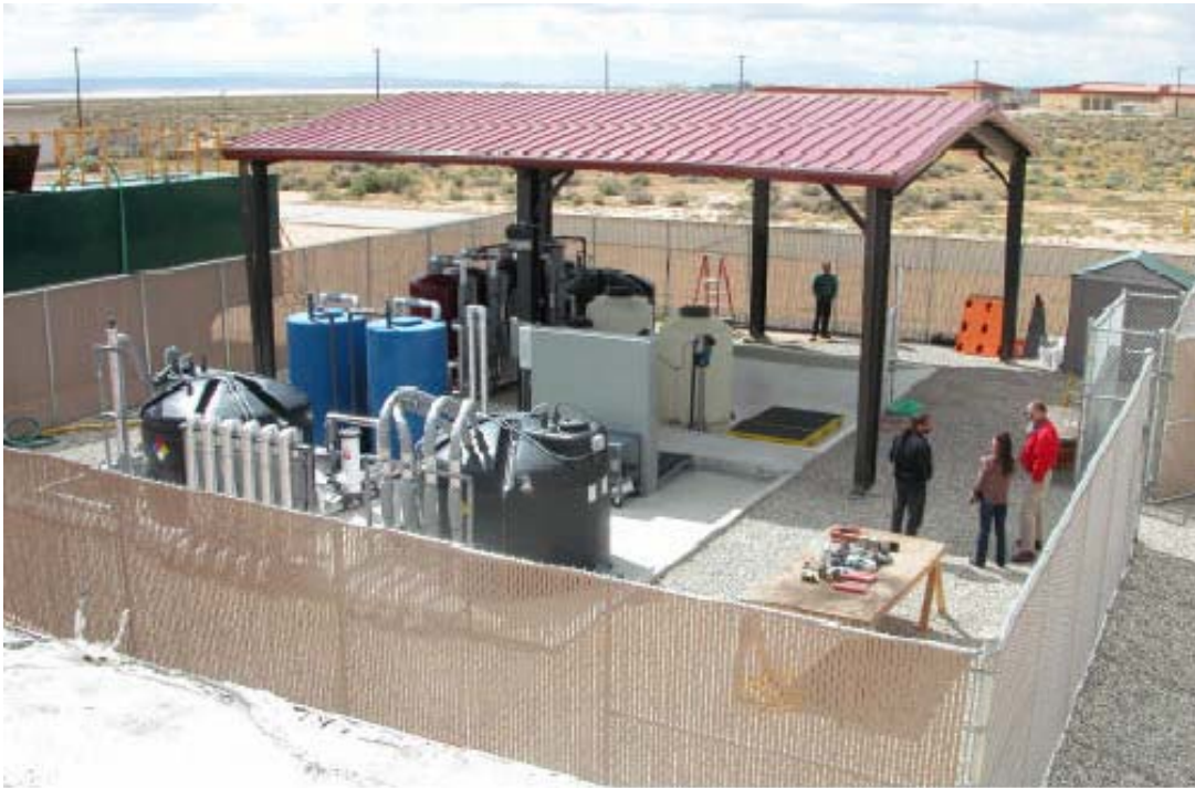
Figure 3 – Ion-Exchange Technology at Edwards AFB

Since its initial operation in May 2003, over 11.2 million gallons of groundwater have been treated, with a little more than 41 pounds of perchlorate removed.