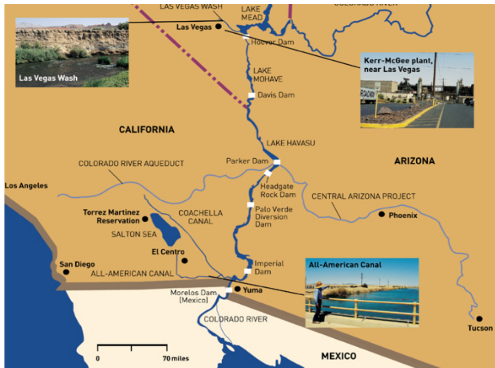
Figure 1 – Study Area