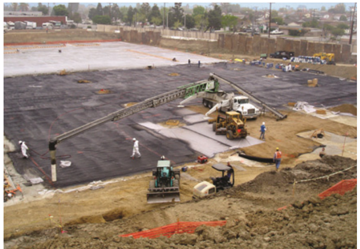
Figure 12. Installation of a spray-applied barrier at a large site.