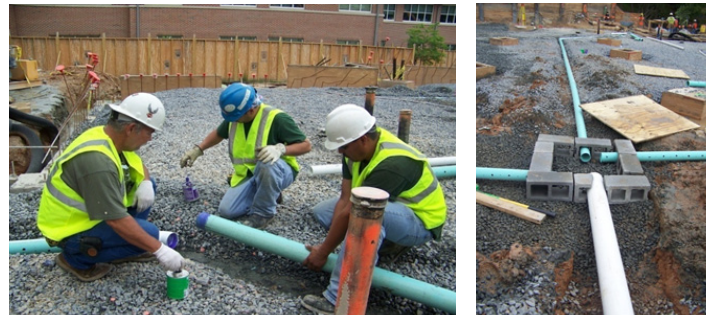
Figure 4. Connecting isolated slab areas with a central plenum box.

The most efficient way to vent sub-slab soil gas is using perforated ventilation pipes that run beneath the slab and direct the vapors to a centrally located plenum box. The plenum box is constructed of hollow concrete blocks turned on their sides with an empty space in the center (Figure 4).