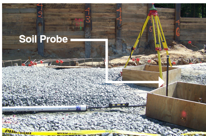
Figure 13. Forms for vertical column support pad with embedded soil probes.

During the construction phase, soil probes should be embedded in the crushed stone to allow testing of system effectiveness after the slab has been poured (Figure 13). Probes are embedded because drilling through the concrete creates an unnecessary risk of damaging sub-slab utilities and will void most vapor barrier warranties. Probes should