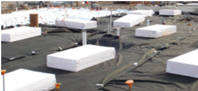
Figure 8. Standard vapor barrier with unsealed seams.

Note: Information on the chemical resistance and ability of a particular vapor barrier material to block a particular contaminant should be obtained from the manufacturer of the specific product being considered. Some information may be available on the Web sites for specific vapor barrier products.