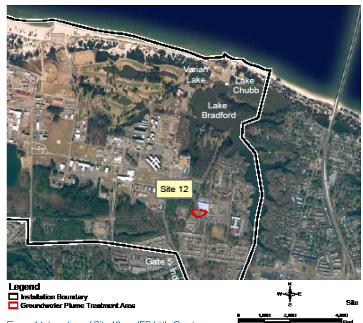
Figure 14. Location of Site 12 on JEB Little Creek.

Site 12 is the location of the former Navy Exchange laundry/dry cleaning facility (Building 3323), which was demolished in 1987. The site is situated in the eastern portion of JEB Little Creek just south of the new Commissary (Figure 14). In the 1970s, dry cleaning wastes, including PCE sludges, were discharged from Building 3323 to the storm sewer. Environmental investigations of Site 12 indicated that the groundwater contained VOCs including PCE and its breakdown products; TCE, cis-1,2-dichloroethene (cis-1,2-DCE), and vinyl chloride. The highest concentrations of VOCs were present beneath the planned parking lot next to the location of the new Commissary, although the plume did not extend beneath the Commissary itself (Figure 15). Because of this close proximity to the plume, it was decided that a VI mitigation system should be installed during construction of the new Commissary as a precautionary measure.