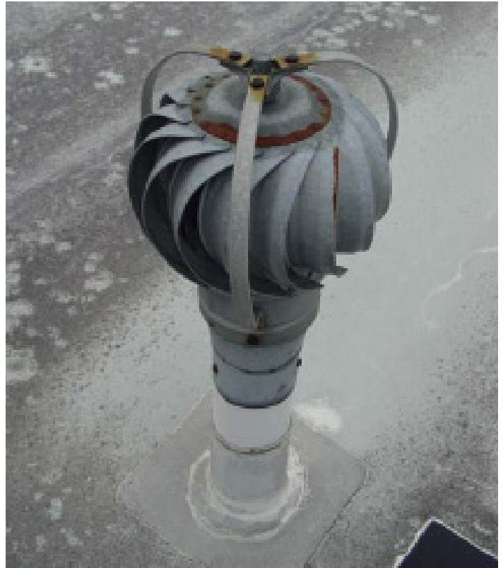
Figure 16. Roof vents fitted with wind turbines provide slight depressurization of the sub-slab area and prevent the buildup of contaminants beneath the building.

In addition to the mitigation system in the Commissary, groundwater remediation has been implemented to treat the source and reduce the extent of the groundwater plume beneath the adjacent parking lot. The selected remedial action was enhanced reductive dechlorination using injection of a trademarked emulsified oil substrate along with land use controls and groundwater monitoring.