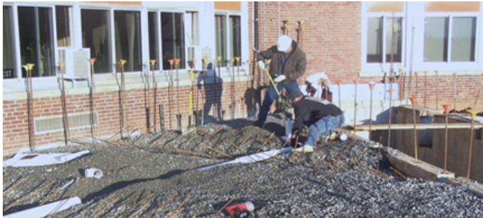
Figure 5. Isolated gravel beds.