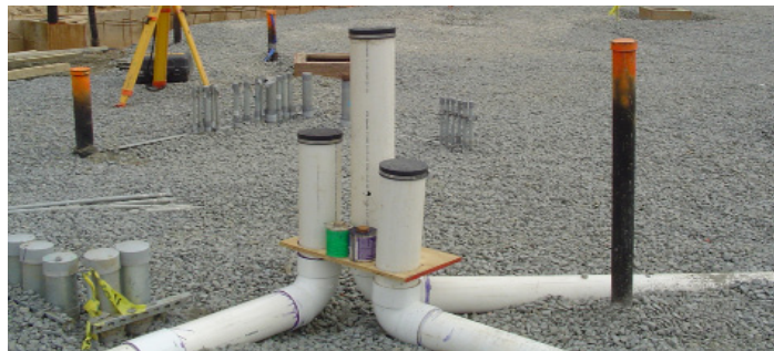
Figure 7. Risers grouped for future pairing and efficient construction.

Conveyance piping can be joined together beneath the slab to minimize vertical risers (Figure 7). A 3-inch riser pipe can service up to 1,500 ft 2 , a 4-inch riser can service up to 4,000 ft 2 and 6-inch riser pipe can service up to 15,000 ft 2 . Sub-slab conveyance pipe should have 5/8-inch condensate drain holes that face down at 4-inch intervals. If factory perforated pipe is used, one set of holes should face down.