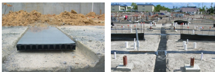
Figure 6. Commercial venting product has properties similar to 4-inch PVC pipe with lower installation costs.

Sizing the conveyance pipe is based on the square feet of the area to be vented and the number of pipe fittings used between the sub-slab plenum box and the vent termination point. Drag coefficient tables exist for different pipe diameters and assorted fittings. Since coordinated drawings are usually not part of the design phase, the person designing the system should plan for twice the number of pipe fittings when calculating the pressure drop associated with a riser pipe system. The most commonly used riser pipe material is polyvinyl chloride (PVC) because of its availability, low cost, and low airflow drag coefficients. No-hub cast iron pipe is used when there is concern of exceeding the flame spread or smoke index. This is a concern when conveyance piping passes through a return air plenum. Protective pipe enclosures or steel pipe is used in areas of vehicle or fork lift traffic.