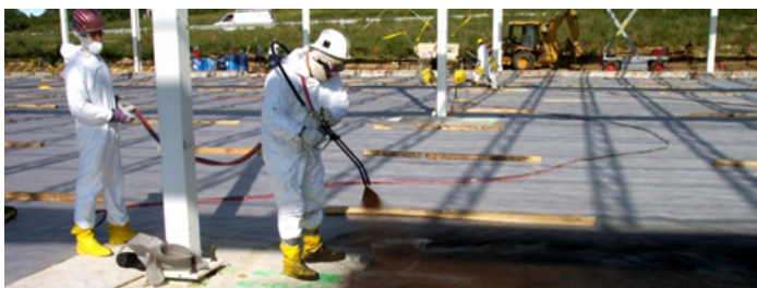
Figure 10. Geotextile fabric is placed over stone followed by spray application of the sealant.