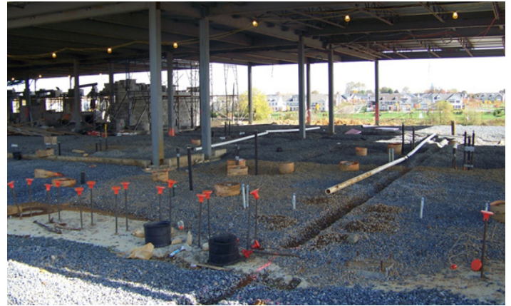
Figure 3. Gravel placed over proof-rolled site with trenching for vent piping.

Eight inches or more of a highly permeable, coarse aggregate such as American Association of State Highway and Transportation Officials (AASHTO) #57 stone is preferred. There should be a minimum of 2 inches of crushed stone above and below any sub-slab conveyance pipe to prevent slab cracking. If 6-inch pipe is used, the ground beneath the pipe may need to be trenched to ensure sufficient crushed stone for slab support (Figure 3).