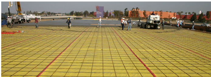
Figure 9. Polyolefin vapor barrier with sealed seams shown with rebar and concrete slab being installed over top.