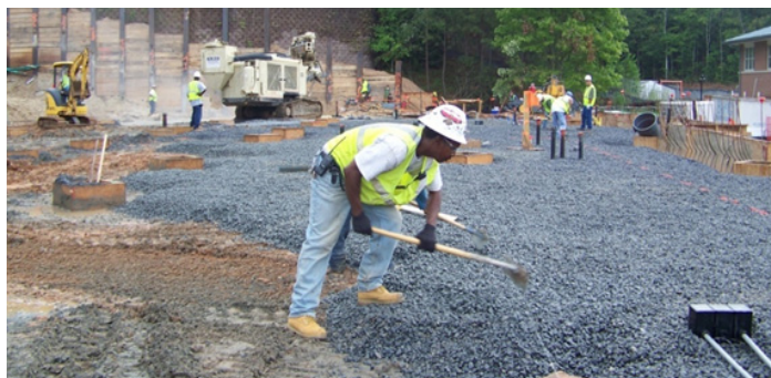
Figure 2. Proof-rolled ground covered with 8 inches AASHTO #57 stone.

After the ground has been proof-rolled by removing undesirable items, drying, leveling and compacting the soil, a permeable layer of crushed stone should be installed (Figure 2).