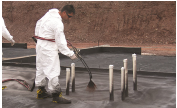
Figure 11. Spraying an emulsified asphalt latex barrier.