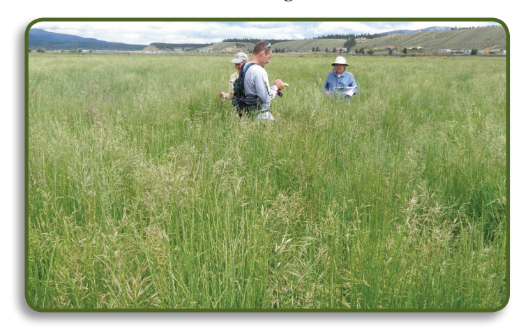
Smith Ranch vegetation assessment, 2010