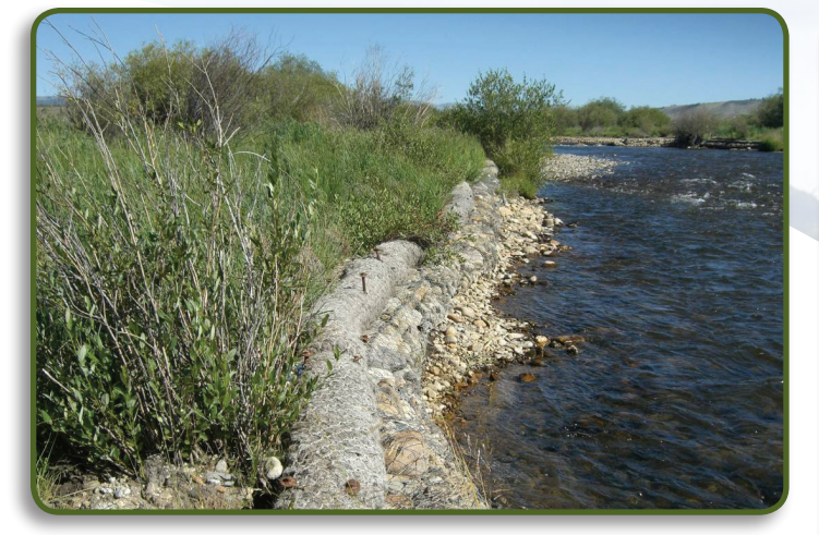
Streambank after treatment

• Irrigation with contaminated water from the Arkansas River impaired the productivity of adjacent ranchlands, causing reduced forage and increased exposure of livestock to toxic concentrations of metals contaminants.