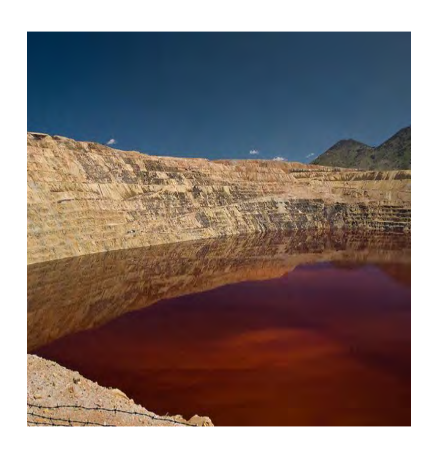
Berkeley Pit in Silver Bow/Butte Area, MT