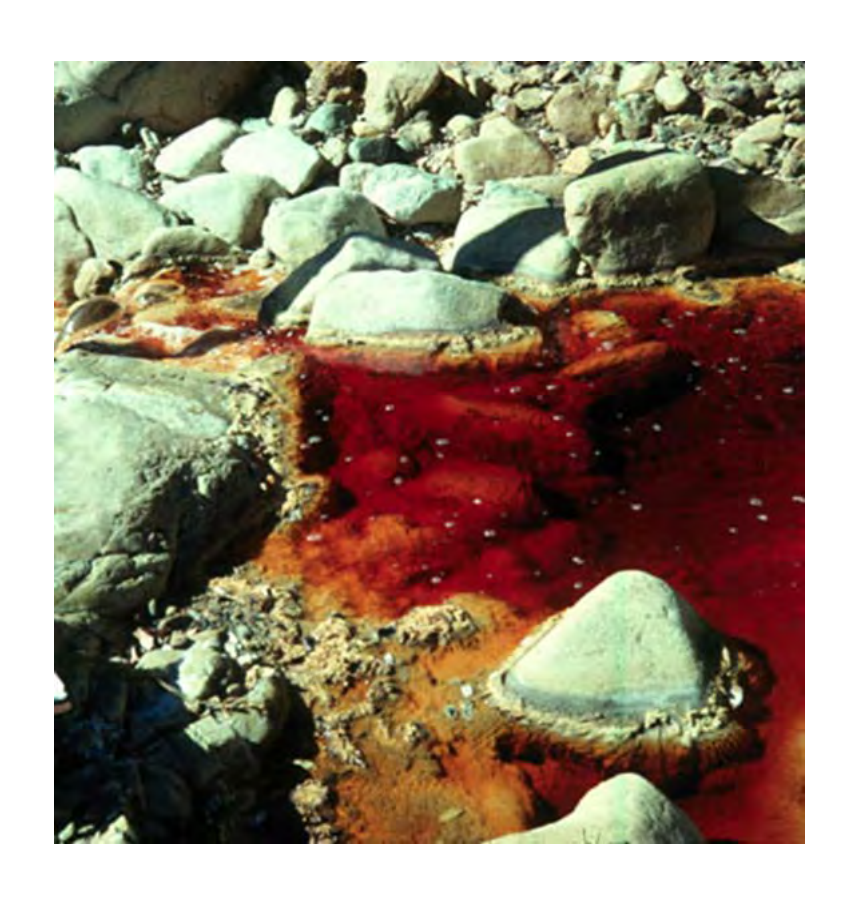
Iron Mountain Mine, CA