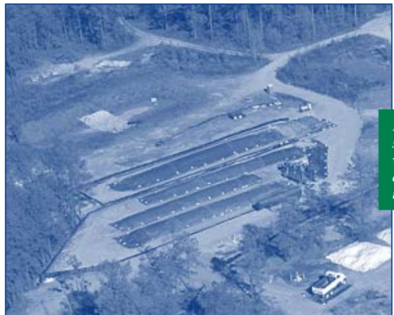
Figure 2. Recent treatability studies on soil bioremediation at the SRS CMP Pits waste site evaluated various combinations of soil amendment applied through windrowing.