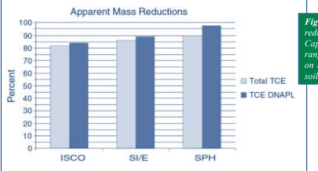
Figure 3. Apparent mass reduction estimates during the Cape Canaveral demonstration ranged from 82% to 97% based on analysis of pre- and postsoil cores.