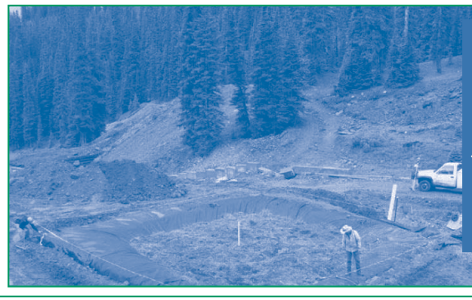
Figure 2. The biochemical reactor occupies a 35- by 35-foot area approximately 200 feet from the mine adit and 25 feet upgradient of the aerobic polishing cell.