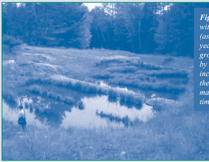
Figure 4. Circulation within the wetlands (as depicted after one year of vegetative growth) is enhanced by inner berms to increase the length of the flow path and maximize residence time of MIW.